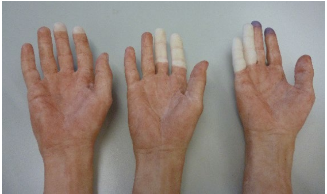
The LUSKInS simulate the impact of HAVS and dermatitis, and have been used to good effect with construction apprentices and workers