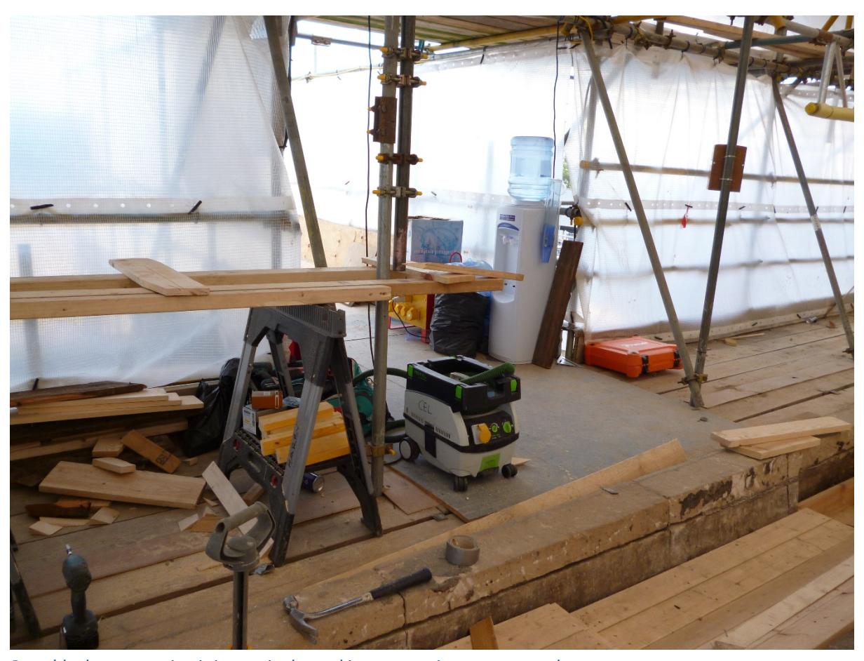
Portable dust extraction is increasingly used in construction to manage dust exposures

First time, it's a full extraction site......Moving on the next job we think is full extraction as well, so that is happening in the industry now .......we had to offer like a pre-quote, and we said, we are now fully extracting, yes.