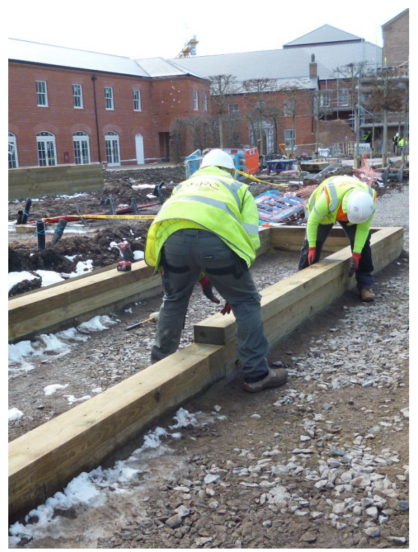
Manual handling and poor working postures are an ongoing challenge in construction, contributing to musculoskeletal disorders which are costly and distressing

Within UK construction, the majority of workers are employed within Small and Medium Enterprises (SMEs, generally defined as organisations which have fewer than 250 employees and a turnover of less than £25 million; but including many 'micros' which have fewer than 10 workers and are generally family companies<sup>3</sup>). There are particular challenges with managing health and safety in smaller organisations: practices here typically lag behind those within larger companies. Reasons given for this