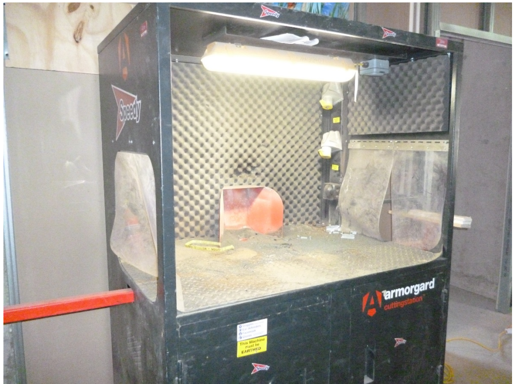
Cutting stations can prevent noise and dust exposures to colleagues working nearby: reducing risk closer to the source and reducing the need for PPE

Expertise in workplace health promotion and health risk management might be held by those other than OHAs. For example, expertise on risk management is also the province of occupational hygienists who, '…control risks to health, by designing out hazards and applying engineering controls to reduce exposures to a minimum.<sup>8</sup>' Increased use of noise and dust monitoring by such specialists would highlight those areas where better controls are needed. Involving them more strategically and also in the design phase of a project would allow early identification of risks which could be designed out or otherwise mitigated. Occupational hygienists were employed on the London Olympics between 2005 and 2012. Since then there has been growing recognition of what they can bring to construction but they are not widely employed in the industry except on very large projects such as Tideway and HS2. Where OH professionals are not employed, for example on small projects, it is particularly important to upskill OSH professionals in these areas.