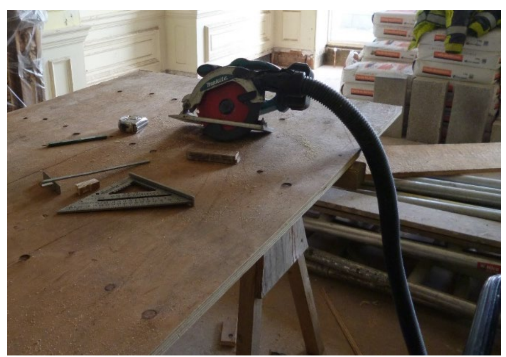
Once workers become used to working with on tool dust extraction, they are more likely to use it by choice on future jobs

Many operational workers interviewed were well informed about risk and its management; they were also highly motivated to take care of their health. Seeing good practice on the current project and previous ones had helped them understand what was possible. This had become habit and was something that was likely to influence their future behaviours — even if they were working on projects where such practices were not mandatory.